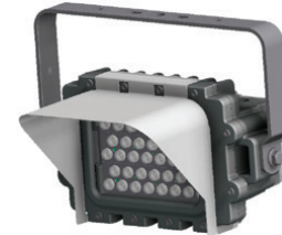
Dark Sky Visor KF1L-DARK