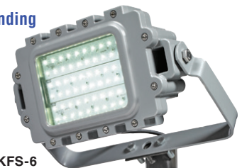
KF1L with KFS-6 Slipfitter mount on 2" pipe